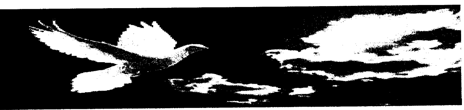
The Spirit of the Lord Is Upon Us All !!!